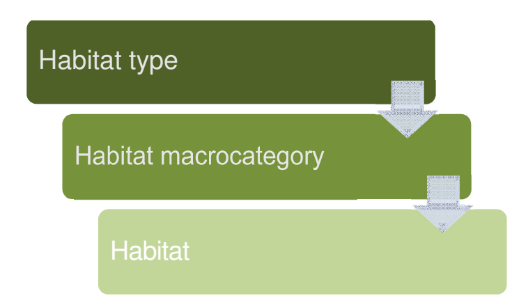
Figure 2.1: hierarchy for habitats of Community interest

The European Directive 92/43/EEC defines nine types of habitats of Community interest, each of which is divided into a set of subgroups, which we call habitat macrocategories, which in turn comprise different habitats, as summarised in the following diagram.