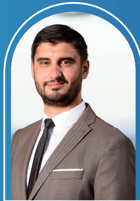
STIPE ČOGELJA Deputy County Prefect of Split – Dalmatia County