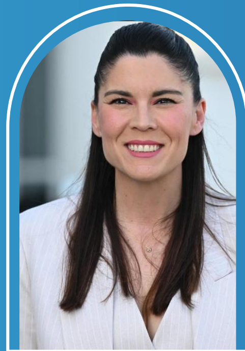
MATEA DORČIĆ Deputy Mayor of City of Split