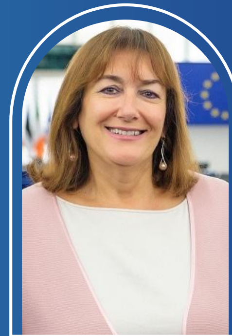
DUBRAVKA ŠUICA European Commissioner for Mediterranean